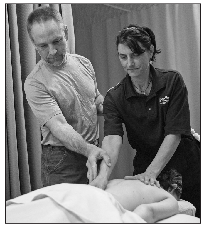
Our teachers are educators as well as practicing massage therapists, creating a powerful learning experience that produces Licensed Massage Therapists of the highest caliber.